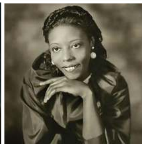
MARY LOU WILLIAMS