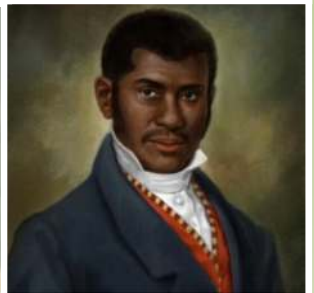
VENERABLE PIERRE TOUSSAINT