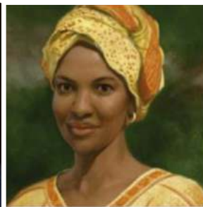
SERVANT OF GOD SISTER THEA BOWMAN