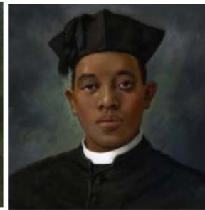
VENERABLE FATHER AUGUSTUS TOLTON