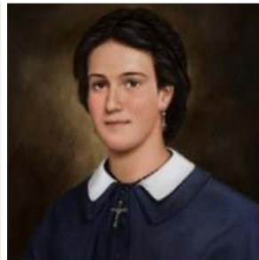
VENERABLE HENRIETTE DELILLE