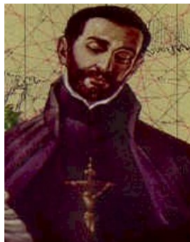
Saint Peter Claver