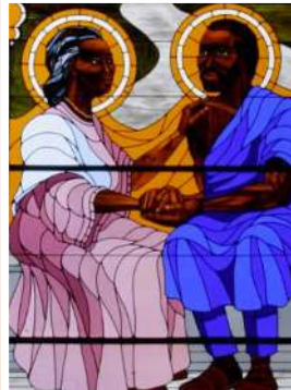
Saints Monica and Augustine