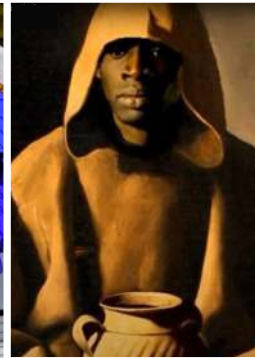
Saint Benedict the Moor