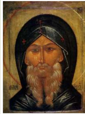
Saint Anthony of Alexandria