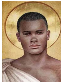
Saint Charles Lwanga