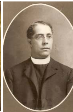
Father Charles Randolph Uncles