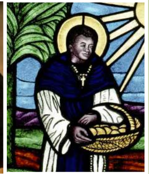
Saint Martin de Porres