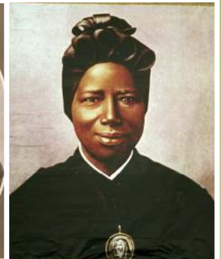
Saint Josephine Bakhita