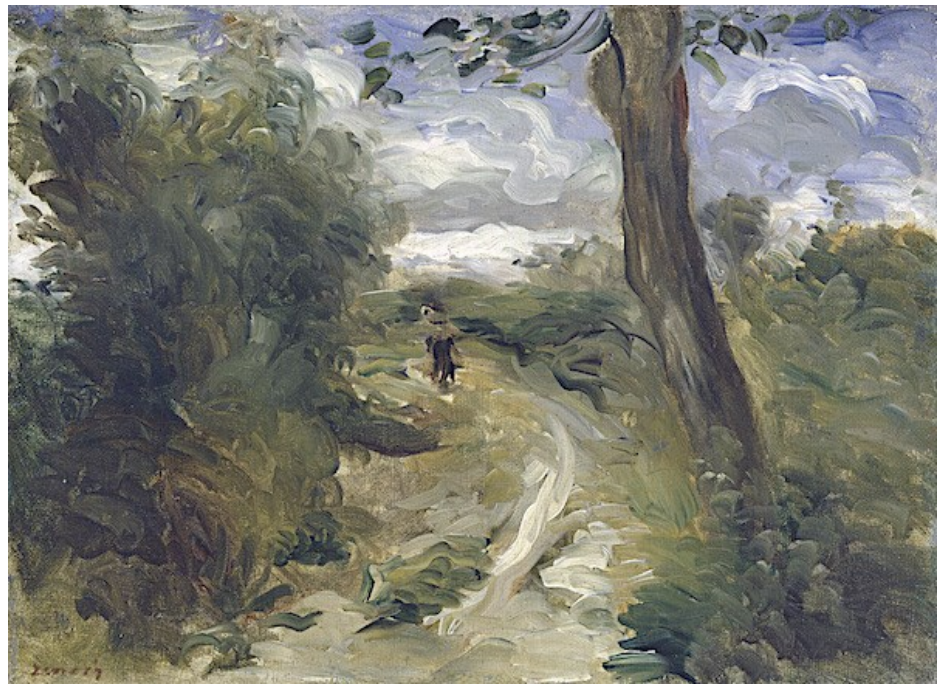
Pierre-Auguste Renoir, Landscape between Storms , 1874/1875

Jesus summoned the Twelve and began to send them out two by two and gave them authority over unclean spirits. (Gospel)