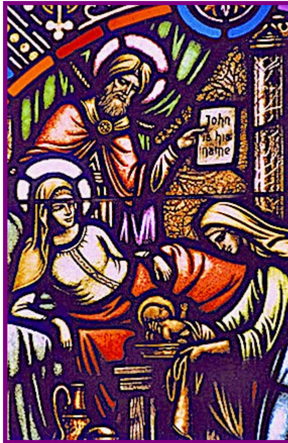
But his mother said in reply, "No. He will be called John." (Gospel)