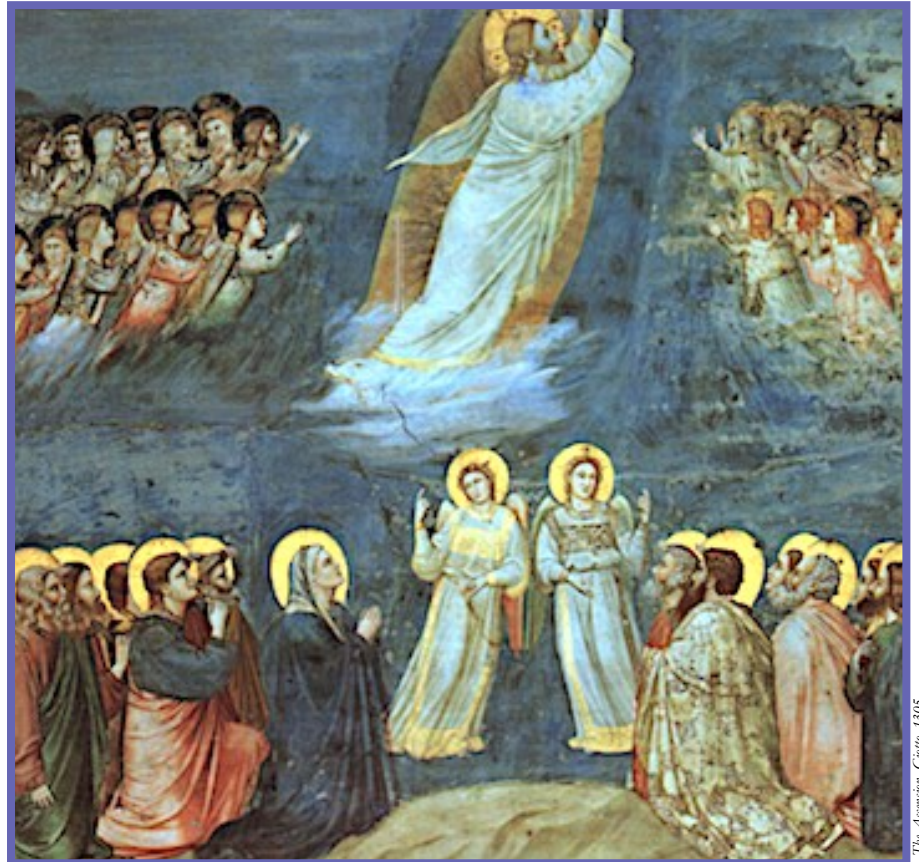
So then the Lord Jesus, after he spoke to them, was taken up into heaven. (Gospel)