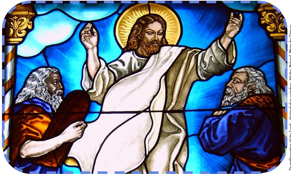
Transfiguration of the Lord - Stained glass window, Michno Poland

Weekday Masses: Monday and Tuesday at 8:30a in the Rectorry; Wednesday at 6p in church. Adoration at 6:30 p.m. Reconciliation: By appointment.