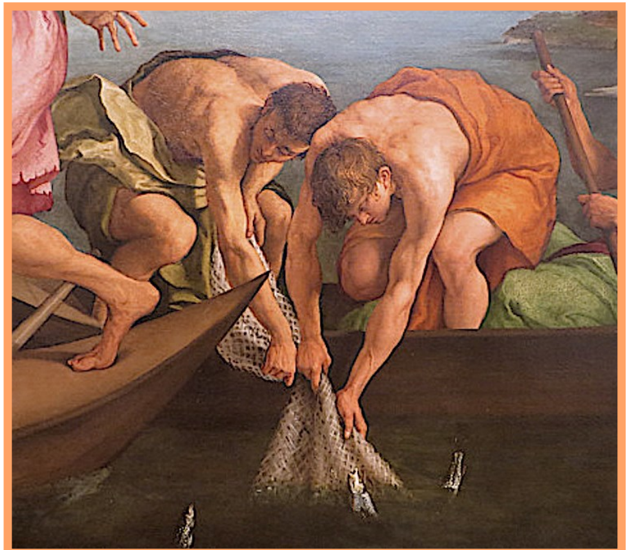
Jacopo Bassano, Miraculous Draught of Fishes (detail) 1545