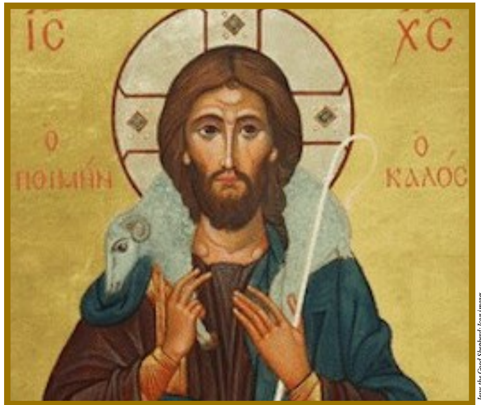
I am the gate. Whoever enters through me will be saved, and will come in and go out and find pasture. (Gospel)

Weekday Masses: Monday and Tuesday at 8:30a in the Rectory; Wednesday at 6p in church. Adoration at 6:30 p.m. Reconciliation: By appointment.