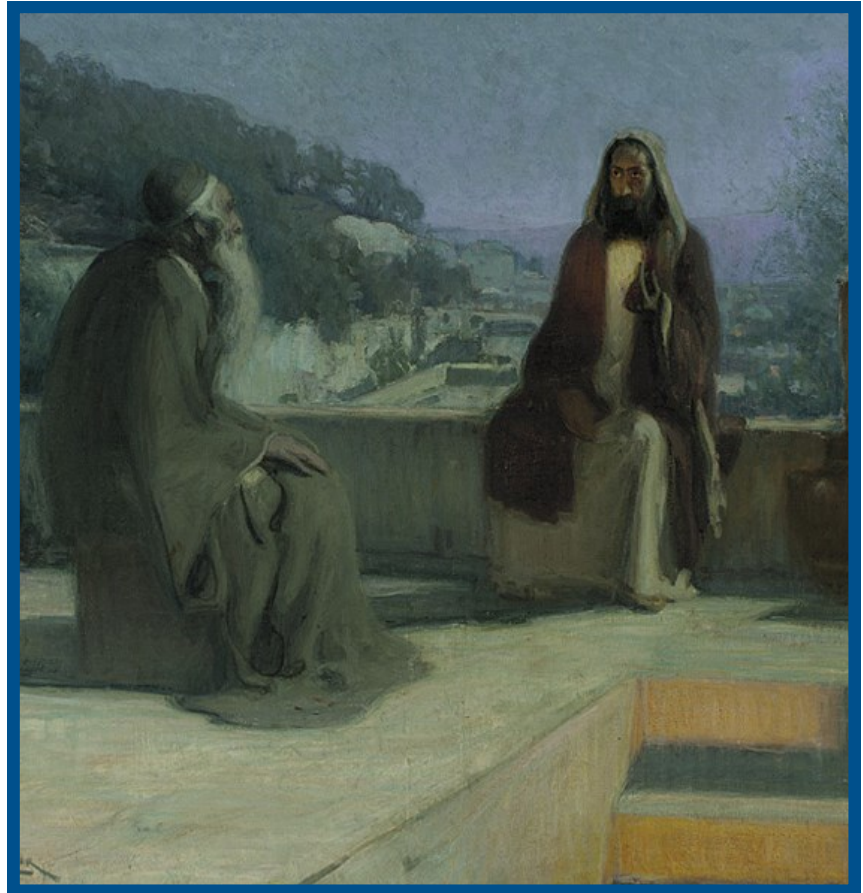
Henry Ossawa Tanner, Nicodemus Visiting Jesus, 1899, Oil on canvas, Philadelphia, Pennsylvania Academy of the Fine Arts

Monday and Tuesday at 8:30a in the Rectory; Wednesday at 6p in church. Adoration at 6:30 p.m. Reconciliation: By appointment.